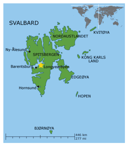
Figure 3 Map of Svalbard